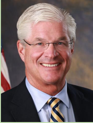
Sen. Mike Shirkey Senate Majority Leader Michigan Senate

S-102 Capitol Building Lansing, MI 48909